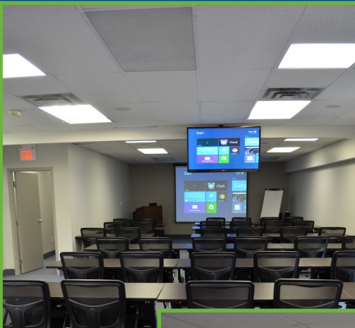
Oakville Classroom (View of Front)